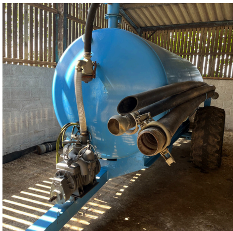
1000 Ltr PTO Tanker