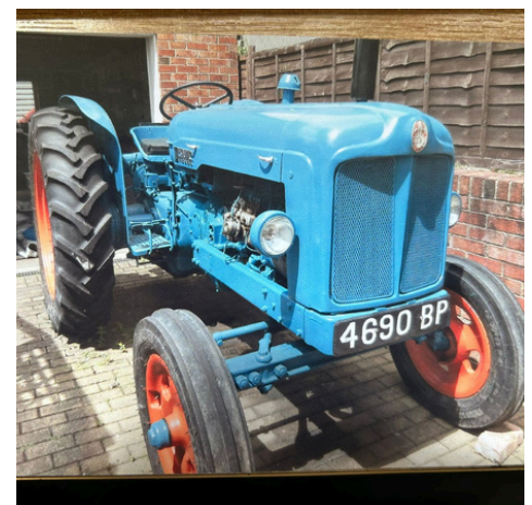
Fordson Major EIA Model Tractor