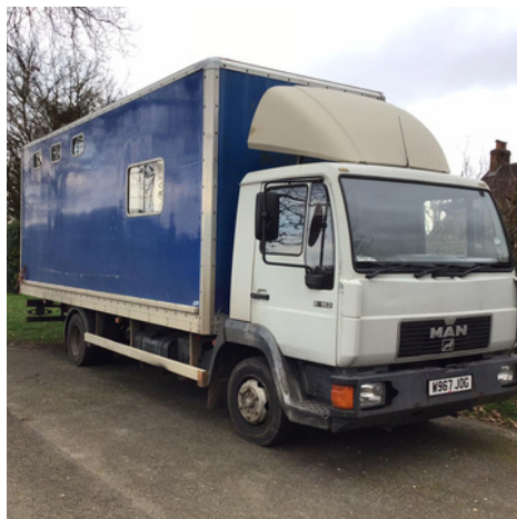
MAN L2000 Horse Box