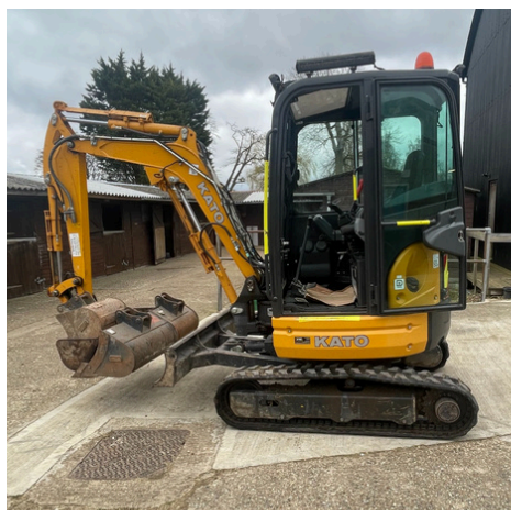
Kato Vfour HD27 2.7 Tonne Digger