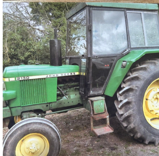
1979 JOHN DEERE 2130