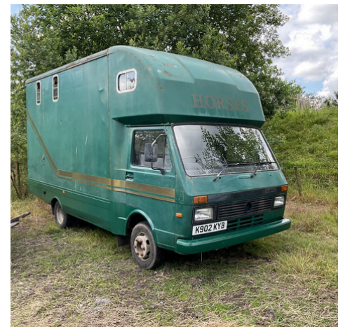
Volkswagen Horse Box