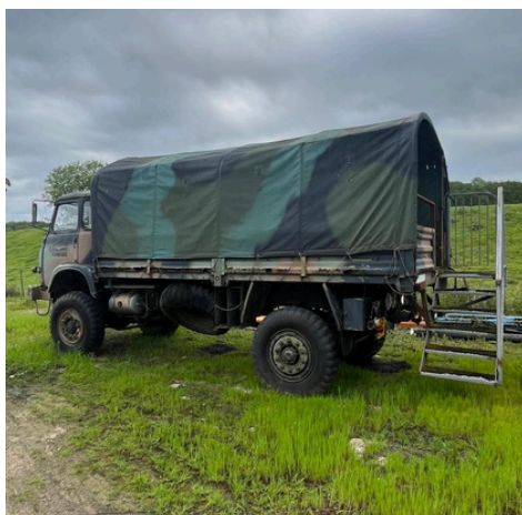
AVIE SM8 Truck