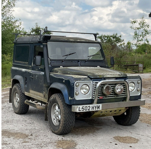
Land Rover 90 Defender TDI

Please see some of the highlighted lots in this auction... For the rest of the auction catalogue, please continue onto the following page.